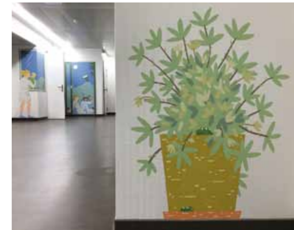
Opposite and above: views of the corridor