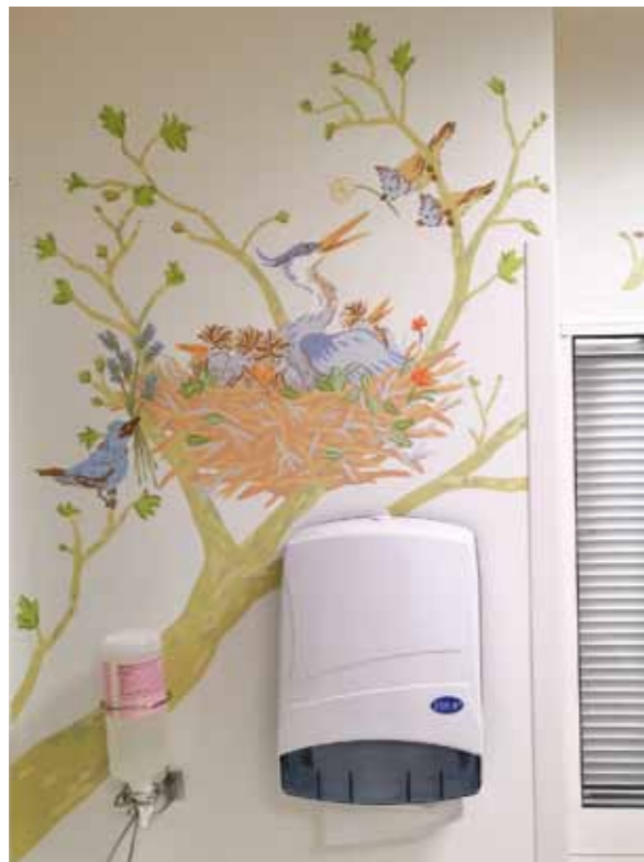
Above: details of room 1308