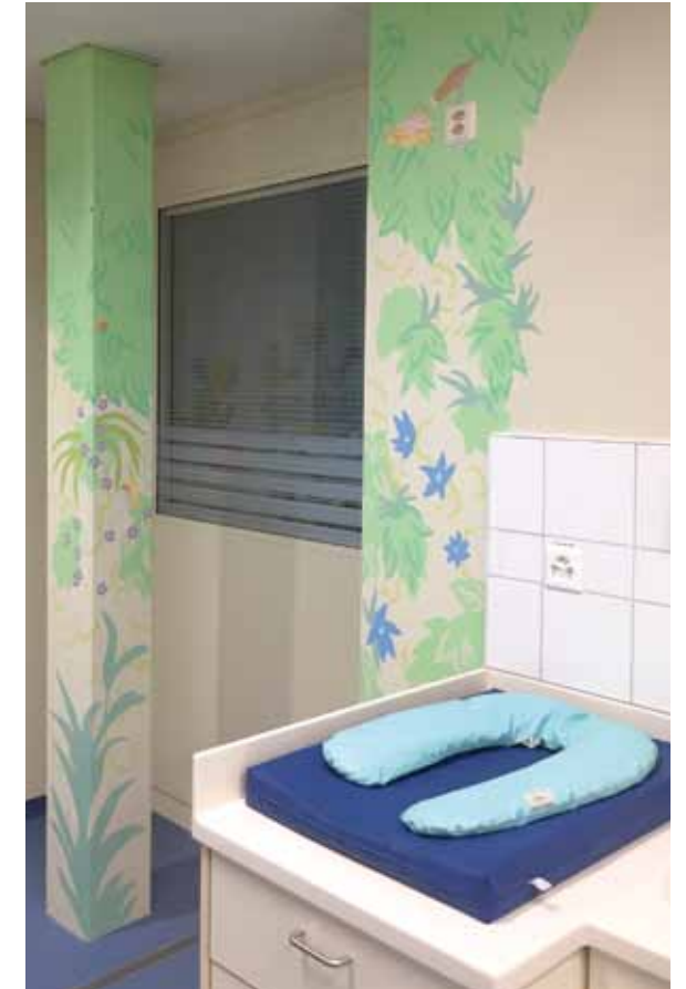
On the left Room no. 44 and on the right Room no. 46