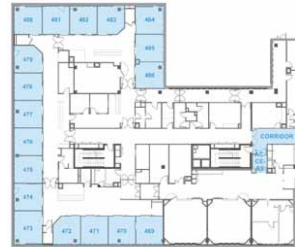
Map of Departments / Decorated areas