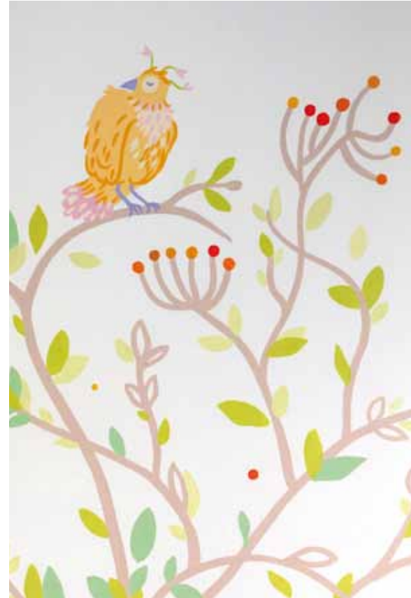
Above and to the right the screening room