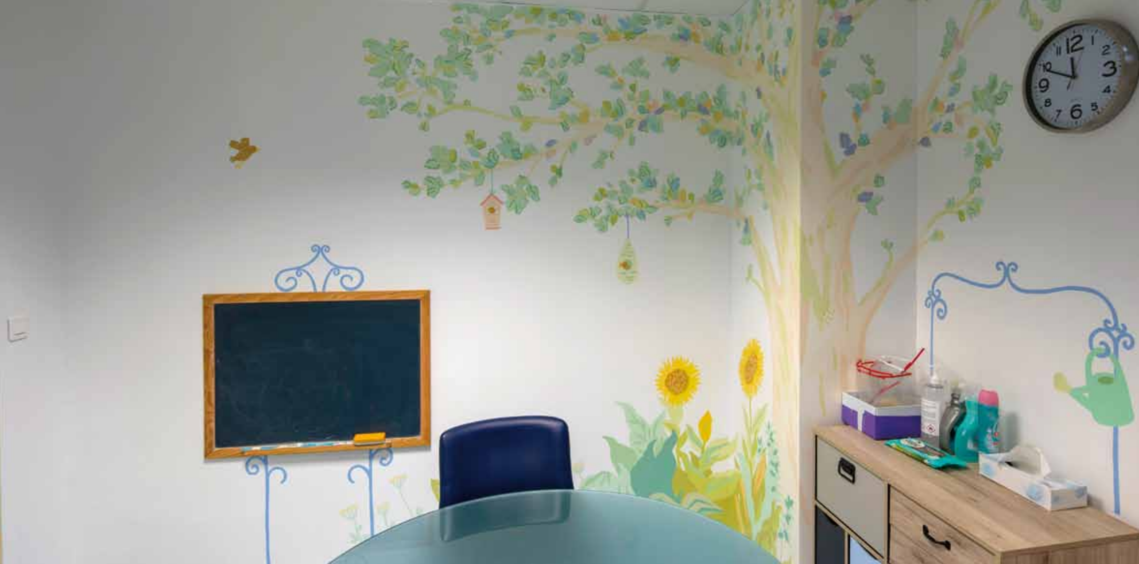
Map of Departments / Decorated areas