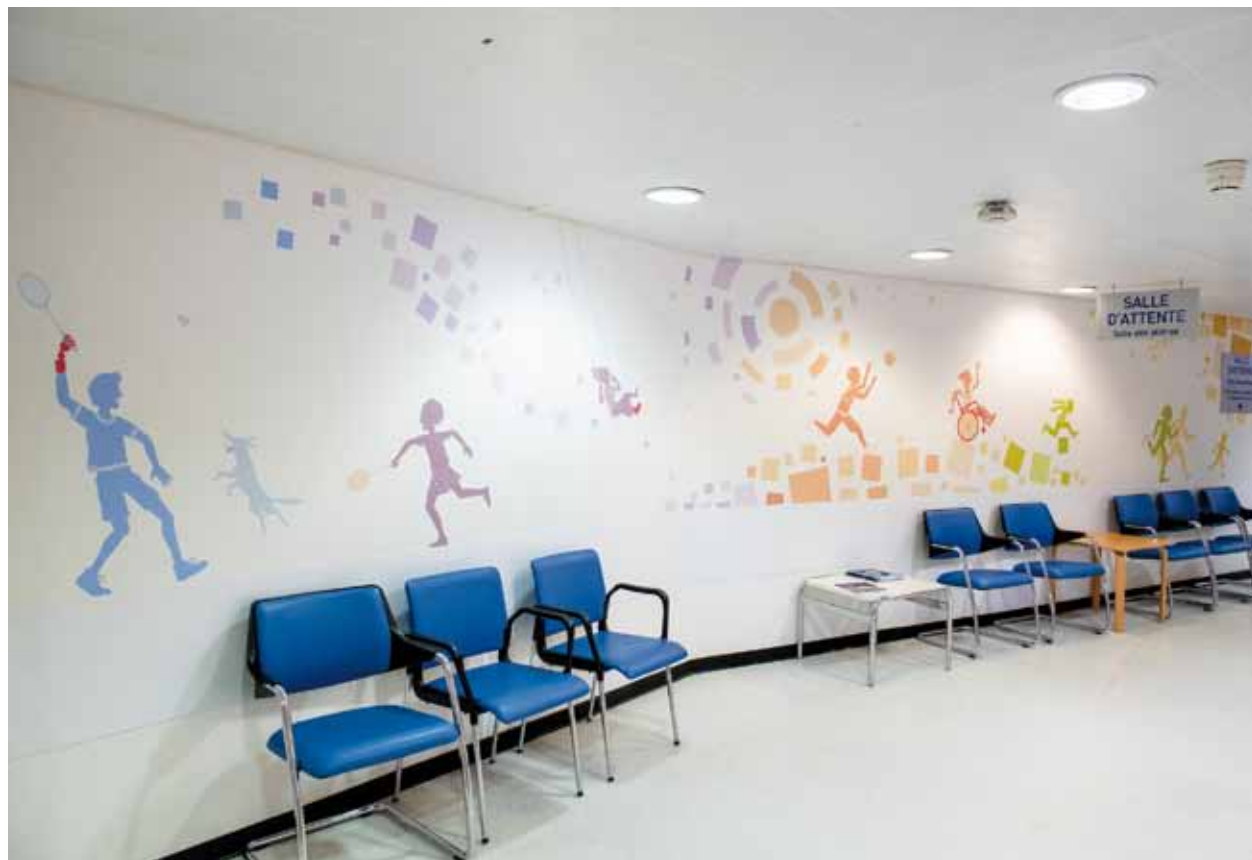
Above waiting room and on the right hypnotherapy room for new-borns