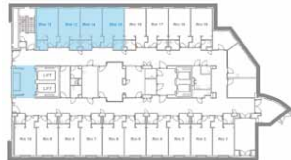
Room 0 - 4 years old